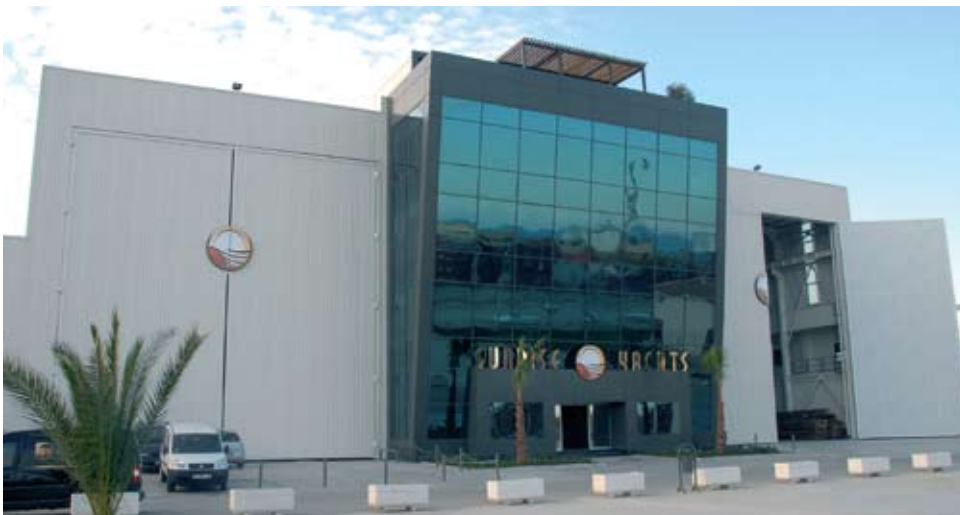
Sunrise Yachts – Antalya